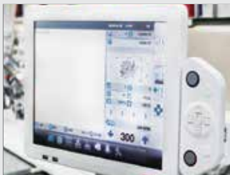
15.1 inch OP box