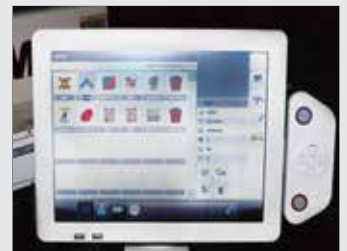
Improvement user convenience