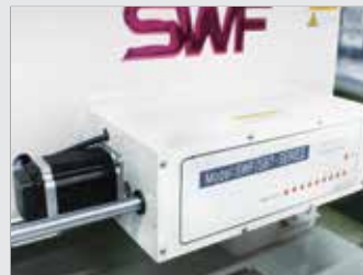
Improvement of color change structure