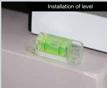
Installation of level

Servo motor is used for X-Y position control, allowing precise control.