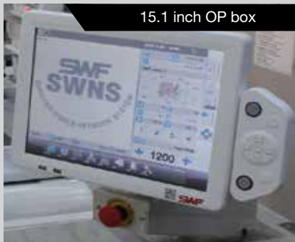
15.1 inch OP box

The new large-area Operation Panel (15.1 Inch) consists of a user-friendly UI.