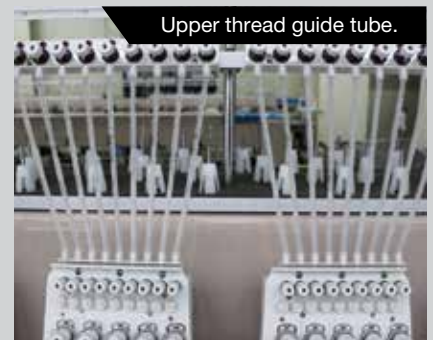
Upper thread guide tube.

Provides anti-vibration mounts to reduce machine vibration.