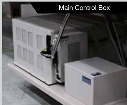
Main Control Box

The new large-area Operation Panel (15.1 Inch) consists of a user-friendly UI.